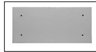
Installation holes on back